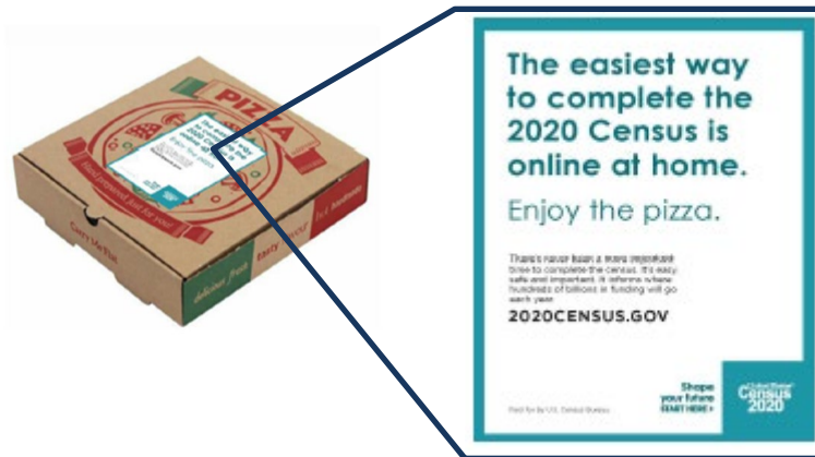
Figure I. Example of Paid Advertisement: Pizza Box Flyer

Source: Census Bureau, 2020 census ICC recap presentation to the National Advisory Committee, November 4, 2021