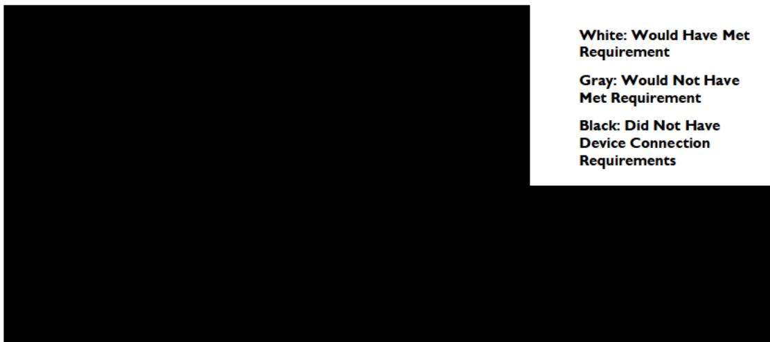
Figure 1. Results of IOC-3 Device Connection Requirements Without Modification 13