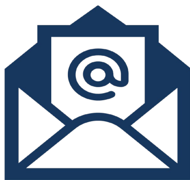
Figure 2. NTIA HVA Phishing Results

During our phishing attack, we observed a higher-than-average clickthrough rate. 8 Although this was not the focus of our work, a high clickthrough rate is concerning because it increases the likelihood of a successful attack by giving attackers more opportunities to gain access. Furthermore, most of those users that clicked our link also entered credentials. These credentials could be used as part of “credential stuffing,” in which attackers use stolen credentials to try to access other systems and applications. 9 Key statistics from our simulated phishing attack are shown in figure 2.